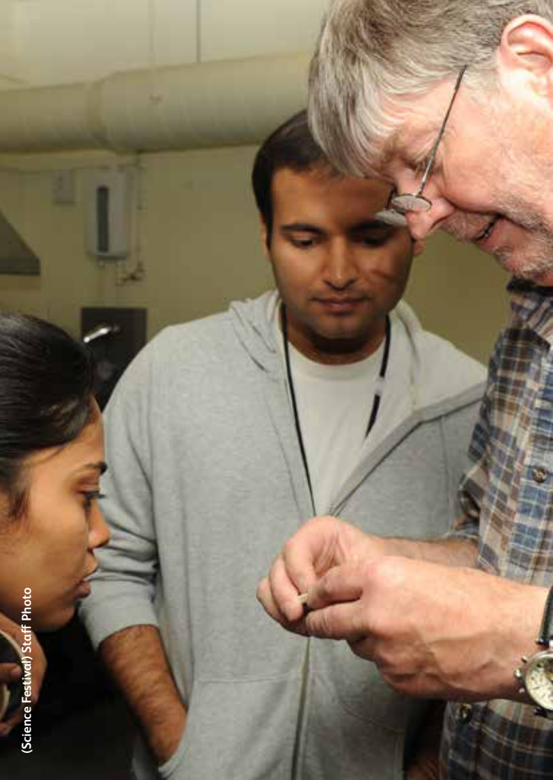
(Science Festival)