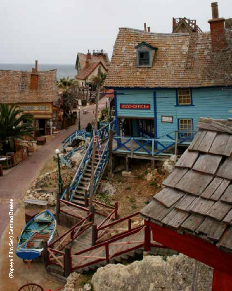
(Popeye Film Set) Gemma Breese